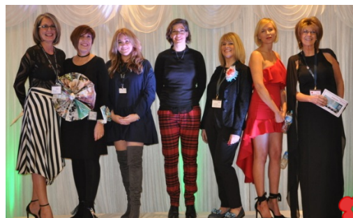
The Shears Academy Team 2018

Thank you for your continued support, now and in the future - we never forget you have a choice!